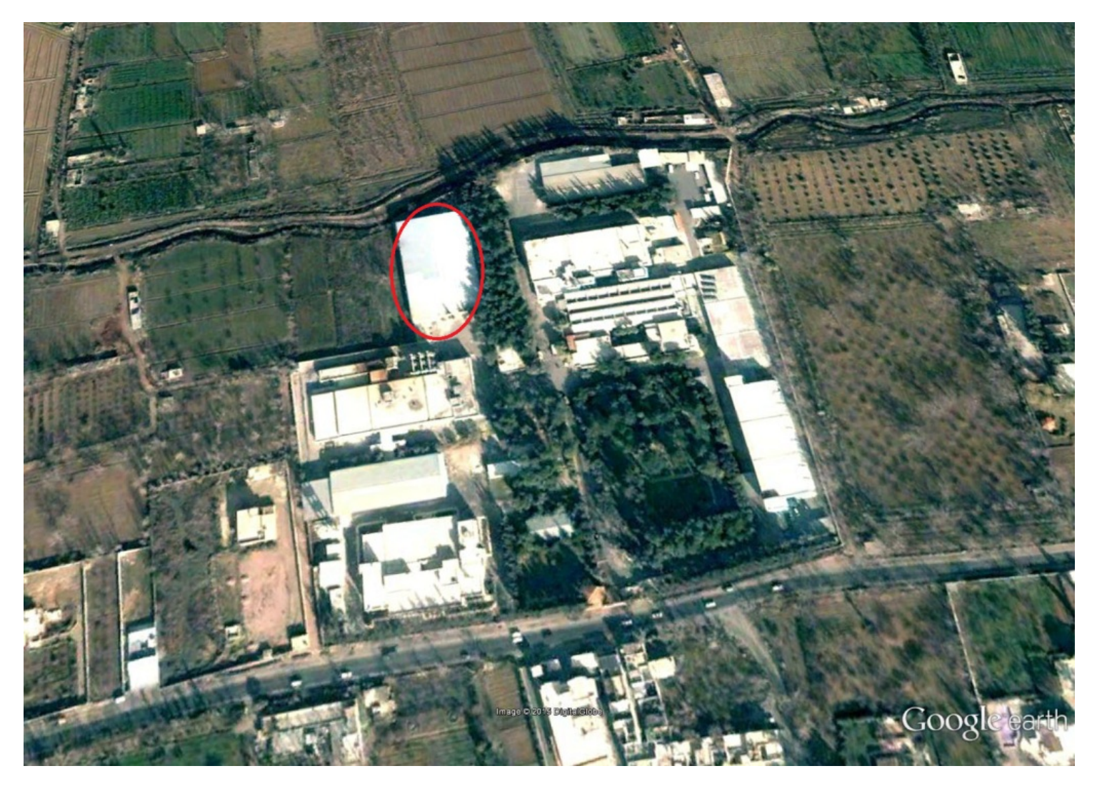
Coordinates: 33°29'49.11"N; 36°22'20.09"E. Images taken on 03/30/2000 (image 1) and 12/24/2003 (image 2).

Today, after the Tameco facility has changed hands several times during the war, not much of the facility is left – it is literally bombed to ashes (image from 8/15/2014).