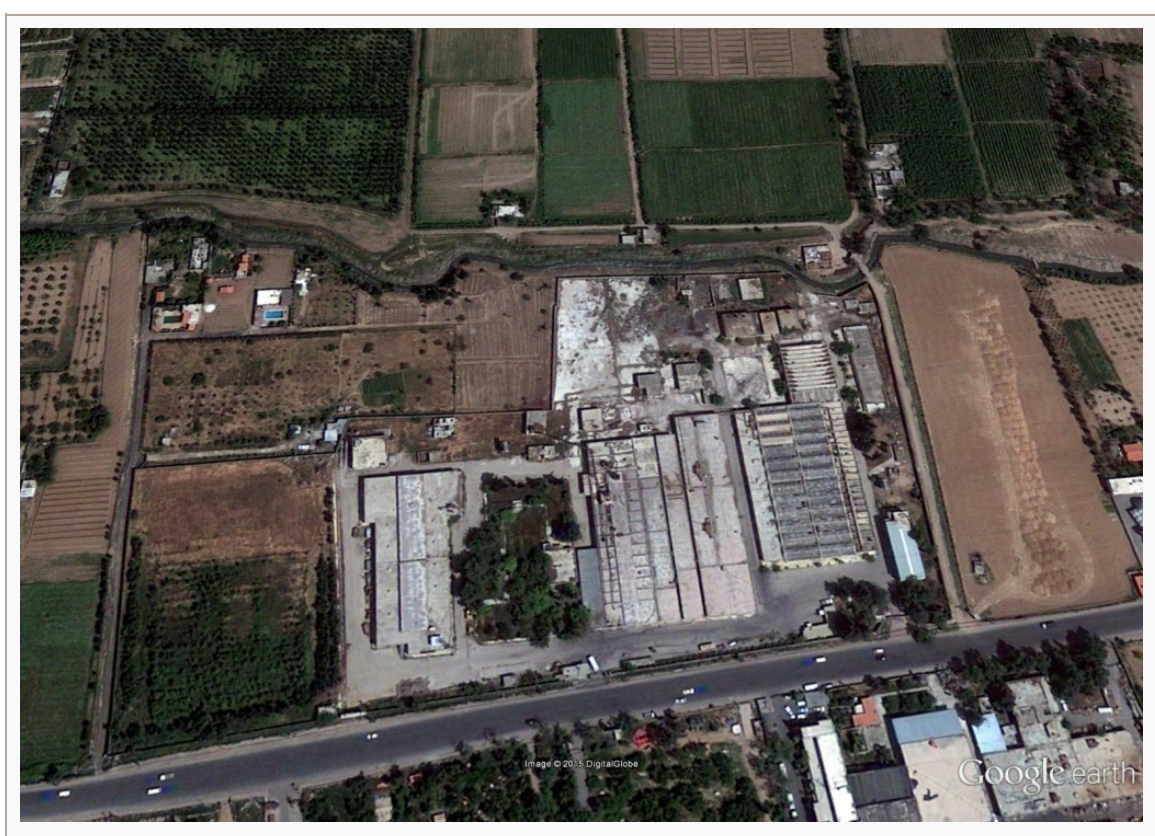
Coordinates: 33°29'33.21"N; 36°21'46.96"E. Image taken on 8/15/2014.